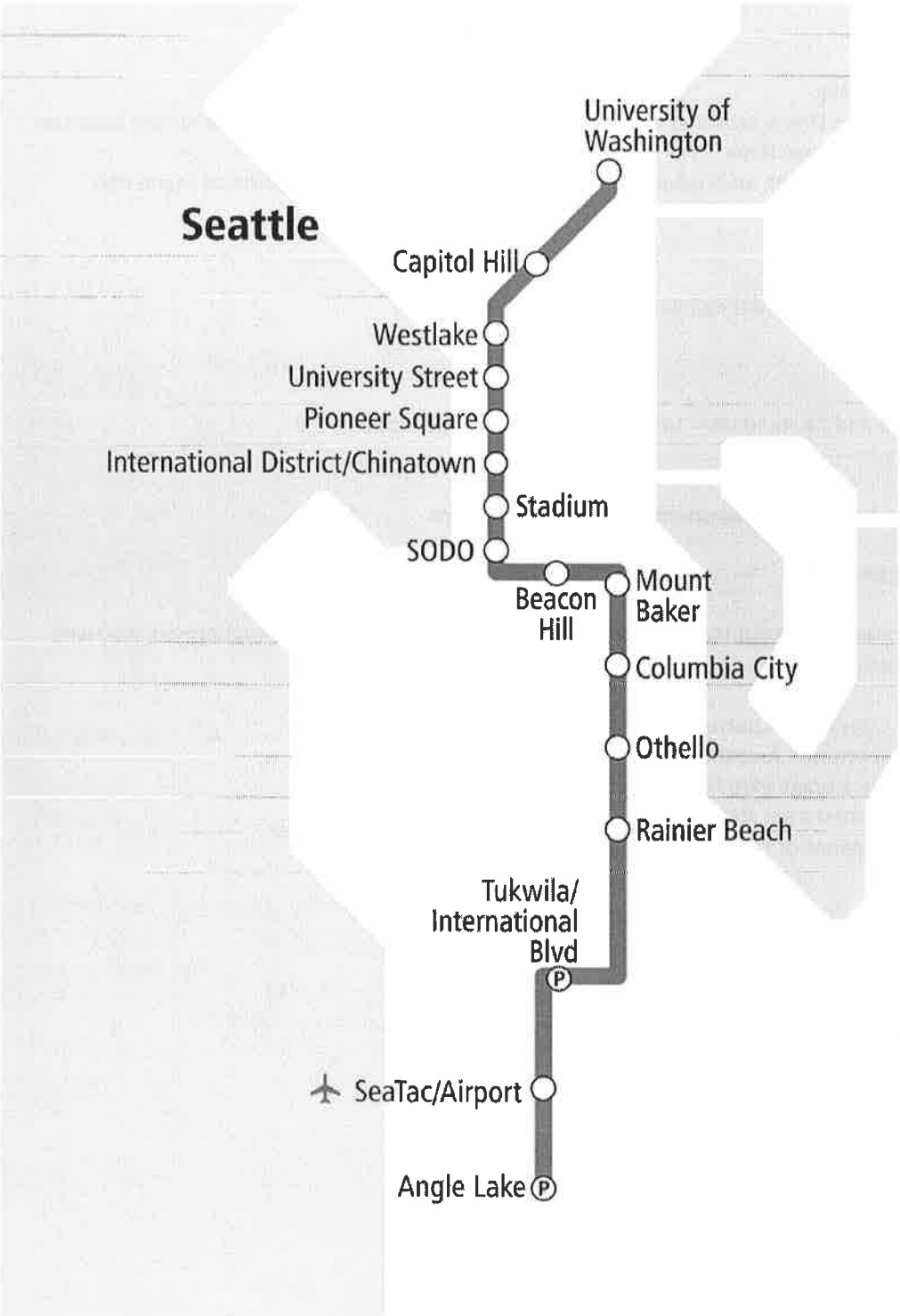
Exhibit B: LINK SYSTEM MAP